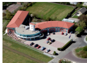
Fletcher Duinhotel Burgh Haamstede **** (Burgh Haamstede)

The hotels and the B&B on this trip have been carefully selected for their location, atmosphere and/or unique services. All rooms are en-suite. A list of the accommodation we work with appears below. If a certain accommodation is unable to confirm due to lack of availability, we will try to request a comparable alternative if possible. When selecting the accommodation, we try to take into account as much as possible a safe and closed bicycle shed. However, we cannot do this with all of them guarantee and this partly depends on the number of bicycles of other guests.